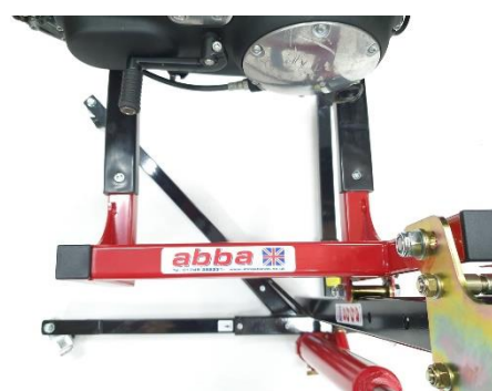
Wrong Position: Lift too far out.

When lowering the bike ensure nothing will come into contact with the lift or bike (Do not leave anything under lift!) – Lower down slowly until the bike wheels touch the ground and slide lift out from under bike.