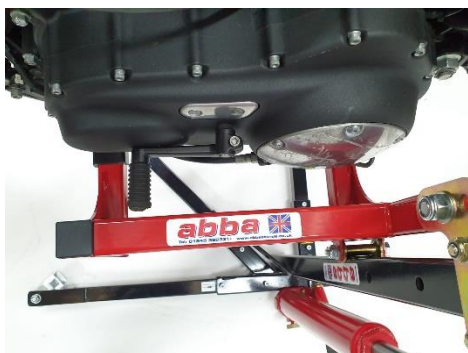
Correct Position – Lift pushed fully in.

When sliding the Sky Lift under the bike ensure the lift is pushed fully under the bike as far as possible, as show below, this will alleviate any excess leverage on the lift.